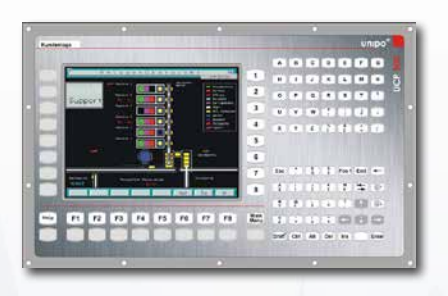
Replacement: unipo® UCP500