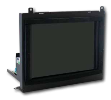
Replacement: unipo® UFP3