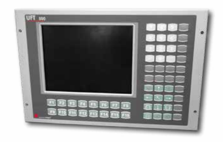
Replacement: unipo® UFT500