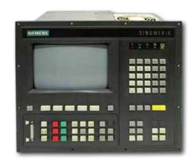
Original: Siemens Sinumerik 810