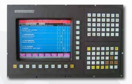
Original: Bosch Indramat BTV