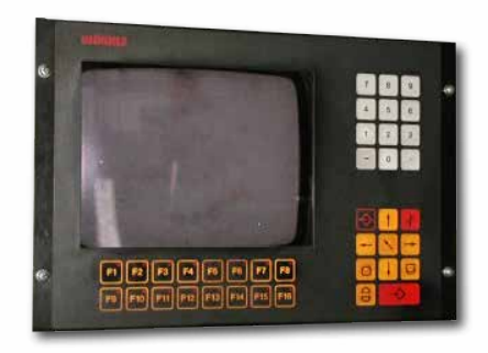
Original: Wöhrle CB-09